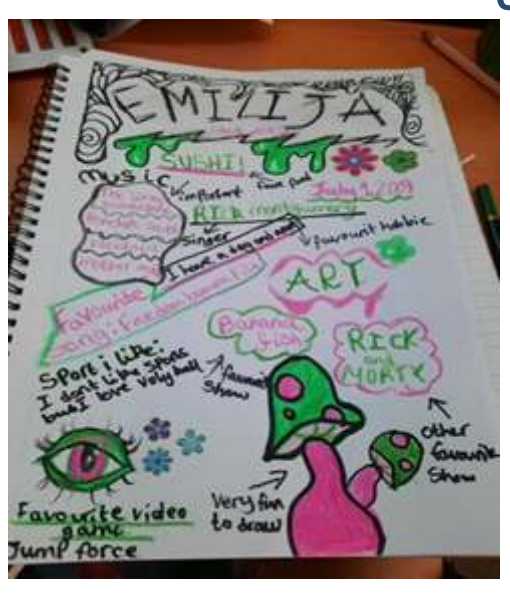
-Chi Ling Chu