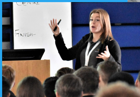
Top and middle images: Year 9 language students present their school clothing range designs, models and research. Above: Exhibition of Year 9 students' 'Identity' project artworks at St John's Church, Peterborough. Left: Dangers of Vaping seminar.