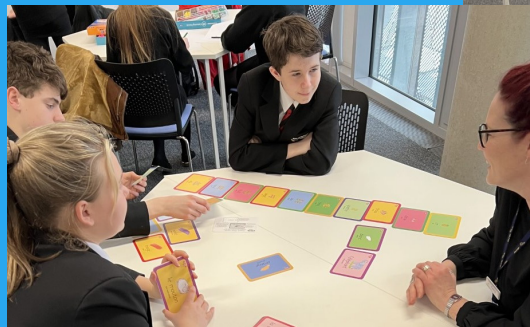
Top image: Year 9s perform at Hampton Green. Bottom left and right: Year 9s attend business and marketing workshops at Anglia Ruskin University, Peterborough.