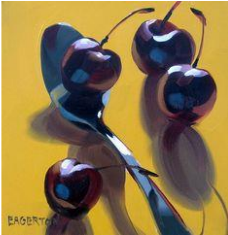
4 cherries with spoon, 2010

Suggested medium: Acrylic/watercolour, Pastels, Coloured pencil/ pencil