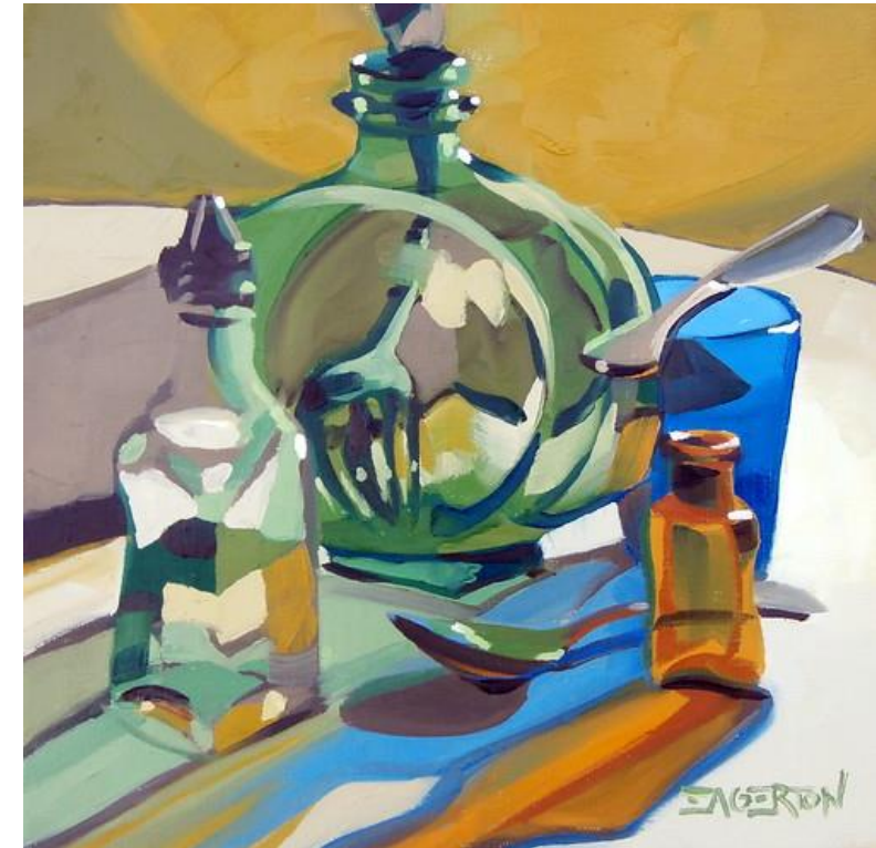
Green Bottle, 2013

Lightly draw out the highlights so that you remember to leave these light.