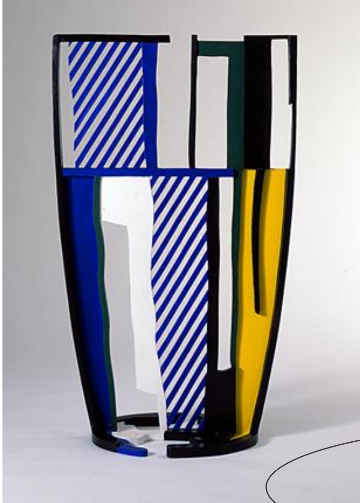
Glass IV, 1977

Suggested medium: Paint, coloured pencils, collage, pencil