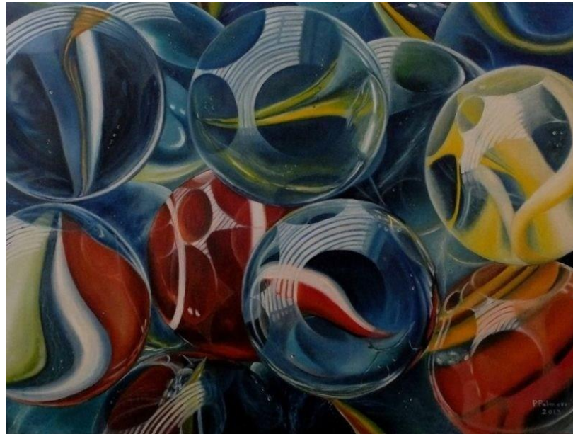
Land of Marbles, 2015

Make sure your pencil is very sharp to get all the details, and draw out your highlights lightly first.