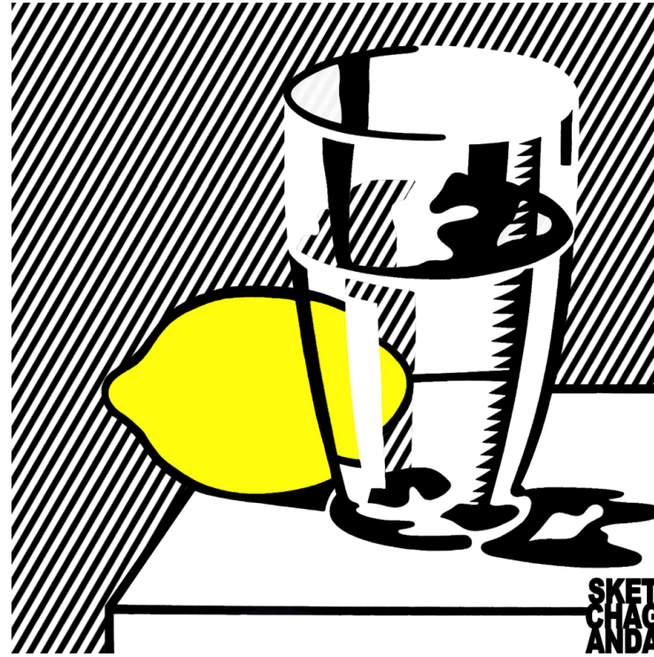
Still Life with lemon and glass, 1974

They may look simple, but take your time and use a straight edge to get your stripes accurate.