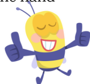
The classic thumbs up