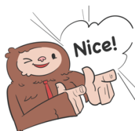
The finger point and wink