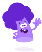
The casual raise of the hand