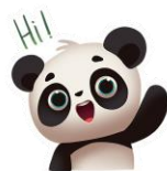
The enthusiastic wave and "hi"